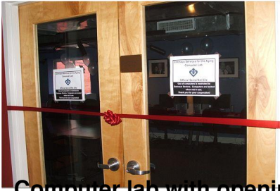
Computer lab with opening ceremony ribbon on the doors