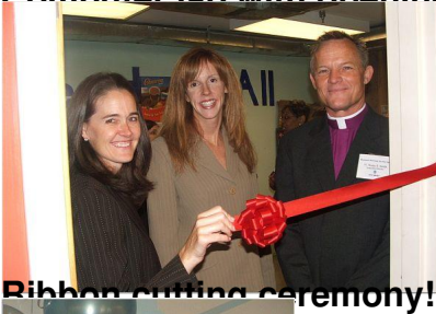
Ribbon cutting ceremony!