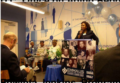
N.C. Office of Aging Representative