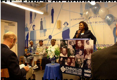
N.C. Office of Aging Representative