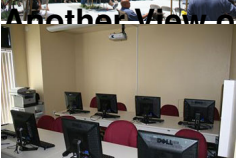
Another View of the Celebration and MAAC Facility