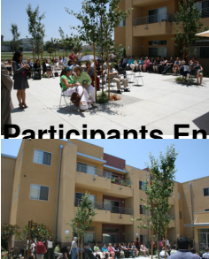
Participants Enjoy the Outdoor Celebration